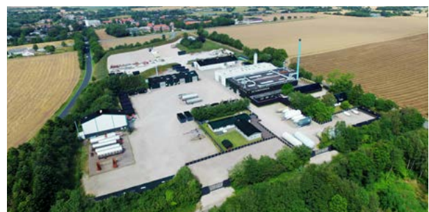
Tunetanken - Vejen

With our great technical expertise, durable fiber reinforced composite materials and innovative solutions, Tunetanken is your guarantee for Danish-made quality developed to optimise your operating conditions today and in the future.